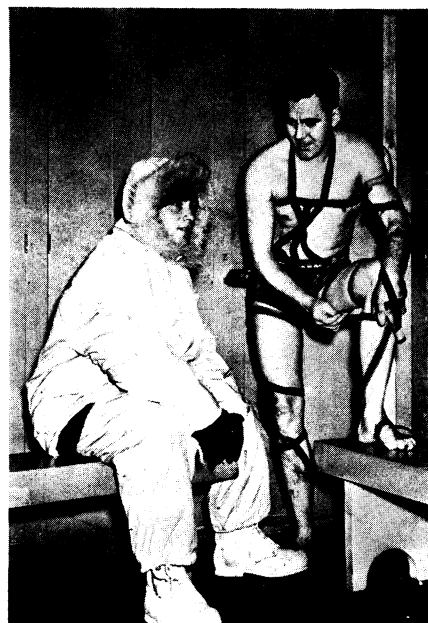
HUMAN GUINEA PIGS —In laboratory rooms simulating all kinds of weather—arctic blizzards, tropical rains, searing desert heats—various kinds of clothing for soldiers are tested by the U.S. Army Quartermaster Corps. Under the piece of clothing being tested, the volunteer wears an electronic contact harness, like the one on the man to the right, which constantly checks the temperatures of eight vital parts of his body.

Without the silvering, the fringes are broad and hazy, and it is impossible to measure from the estimated center of one fringe to that of the next with any great accuracy. With the silvering,