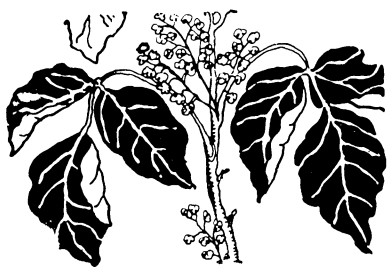
An Unholy Trinity

► POISON IVY , in one form or another, is almost continent-wide in its distribution. It ranges from Ontario southward to Florida and westward into the timberstrips along the streams of the Great Plains. A close relative, the Pacific Coast poison oak, takes up its fiendish job of promoting blisters-and-itch in the Far West.