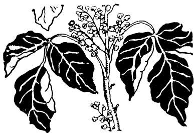
An Unholy Trinity

► POISON IVY , in one form or another, is almost continent-wide in its distribution. It ranges from Ontario southward to Florida and westward into the timberstrips along the streams of the Great Plains. A close relative, the Pacific Coast poison oak, takes up its fiendish job of promoting blisters-and-itch in the Far West.