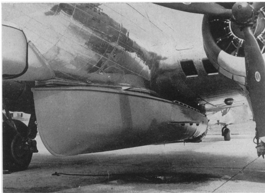
AIRBORNE LIFEBOAT —Fastened under the wing of a Boeing B-17 with clearance a matter of inches, this boat can be dropped into the water from an altitude of 300 feet by means of a rayon parachute.