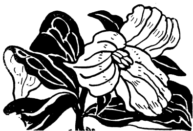
Death and Resurrection

► CHRISTENDOM, during the coming week, commemorates the age-old drama of the death and resurrection of its central figure. Even the least devout, perhaps unknowingly, make use of the traditional symbols of death and resurrection—the seemingly lifeless egg out of which comes new life, the rabbit that springs vigorously out of a hole that might have been taken for a grave, the flowers that emerge from apparently dead seeds and bulbs. Some of these symbols are older than the creed with which they have become associated; even the heathen could not bear the thought of death being the end, and sought cheer and hope in these vernal reassertions of life.