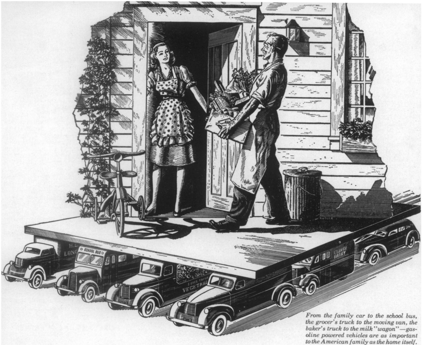
From the family car to the school bus, the grocer's truck to the moving van, the baker's truck to the milk "wagon"—gasoline powered vehicles are as important to the American family as the home itself.