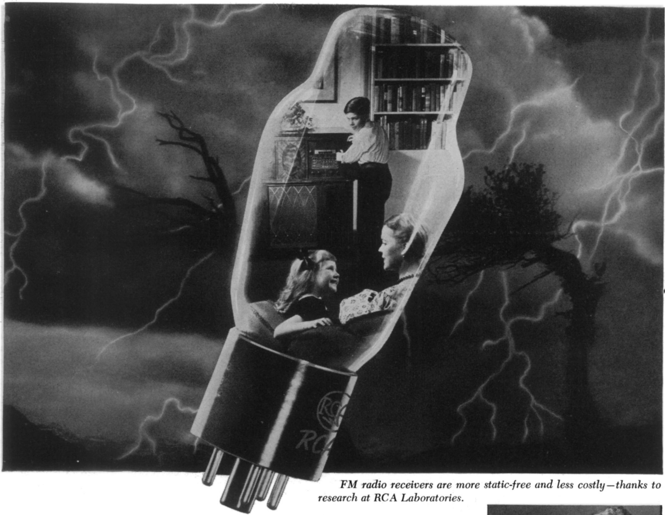
FM radio receivers are more static-free and less costly—thanks to research at RCA Laboratories.