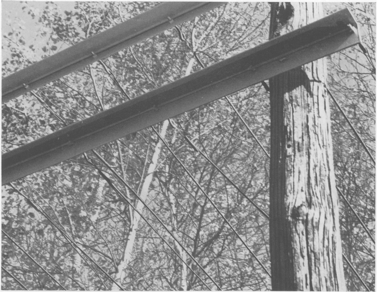
Drop-wire undergoing abrasion tests in birch thicket "laboratory." Below, the new drop-wire, now being installed.