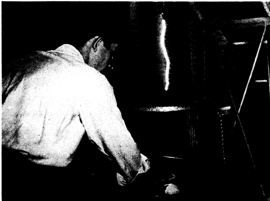
LAB LIGHTNING —Students in the College of Engineering at Duke University make laboratory lightning, replete with claps of thunder. The student operating the one-half-million-volt generator is protected from stray charges by the wire screen.

Cheap oxygen , a matter of much concern in the chemical and other industries, was made in Germany by the fractional distillation of liquid air at extremely low temperatures.