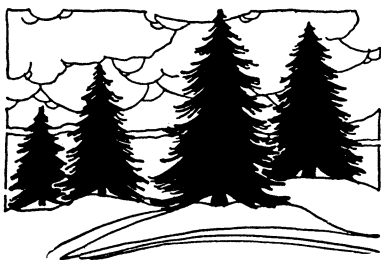
Before the Eagle

➤ ALTHOUGH this country has no national tree, as England has the oak and Canada the maple, a tree was used as symbol of American honor and independence long before the eagle was officially adopted as the device to be used on the Great Seal of the United States and subsequently on our coinage and currency.