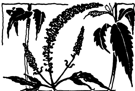
Season of Sneezes

► THE ragweeds, low and tall, will begin shedding pollen in the northern states in a few days, and will continue to keep sensitive noses and eyes miserable until well into September. In the South, ragweed pollen seasons begin later, about mid-August or even the first of September, but last into October. Southernmost ragweed patches, far down in Texas and Florida, however, seem able to pour their irritating dust into the breezes from early July until late October, or even longer.