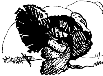
Bird of Opulence

► THERE is a movement among turkey raisers to develop a small bird more commensurate with the capacities of today's small families. The idea is to reduce the bird to the proportions of a more workaday menu, to remove roast turkey from the category of exclusively feast-day fare.