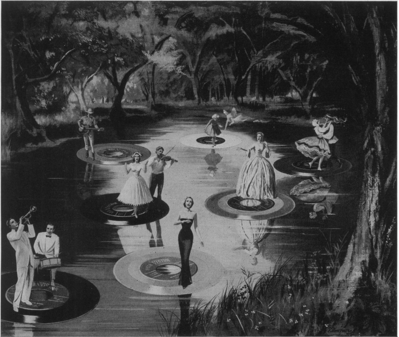
Recorded only in the distortion-free quality zone , music "comes alive" on RCA Victor 45-rpm records.