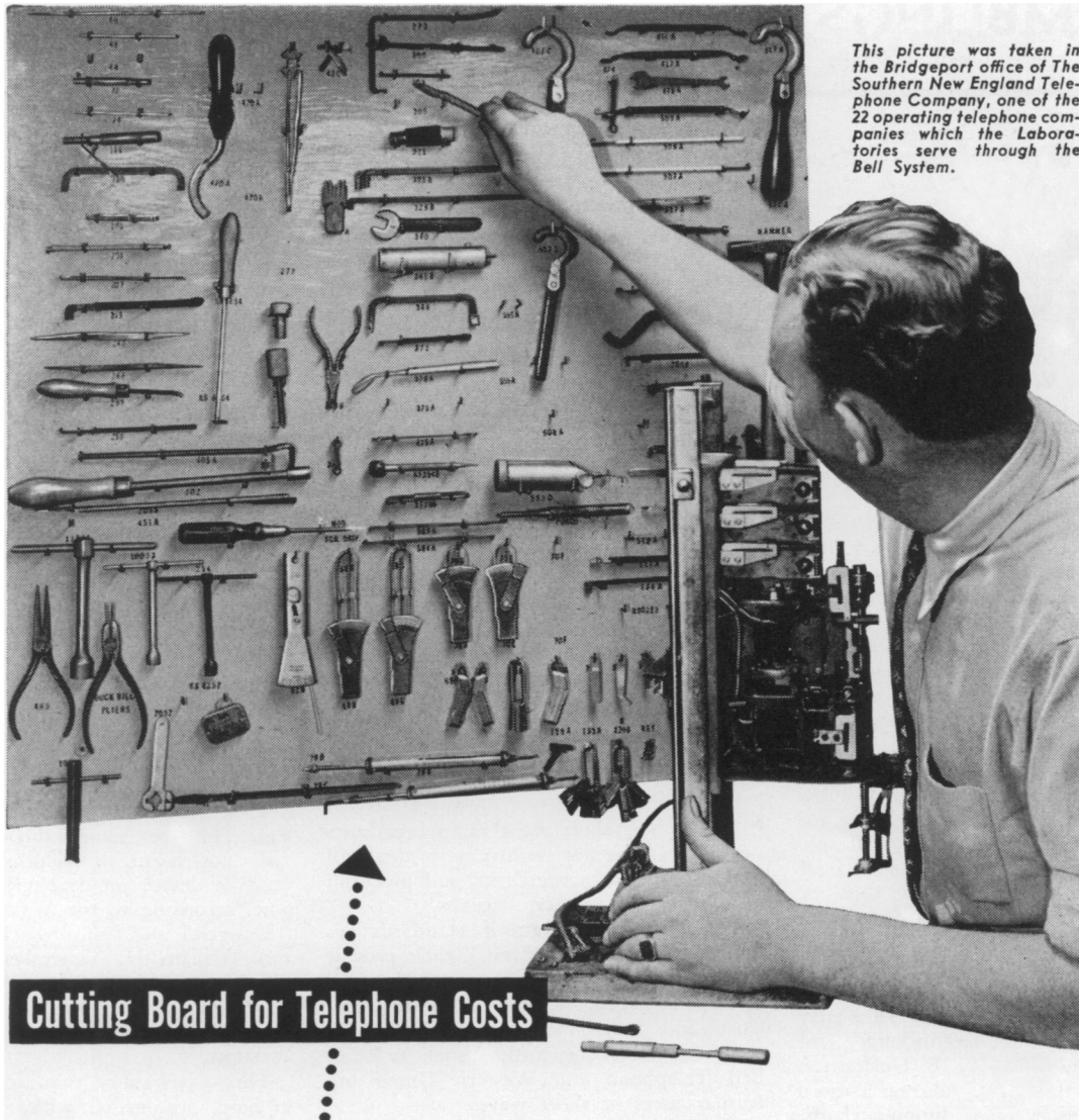
This picture was taken in the Bridgeport office of The Southern New England Telephone Company, one of the 22 operating telephone companies which the Laboratories serve through the Bell System.