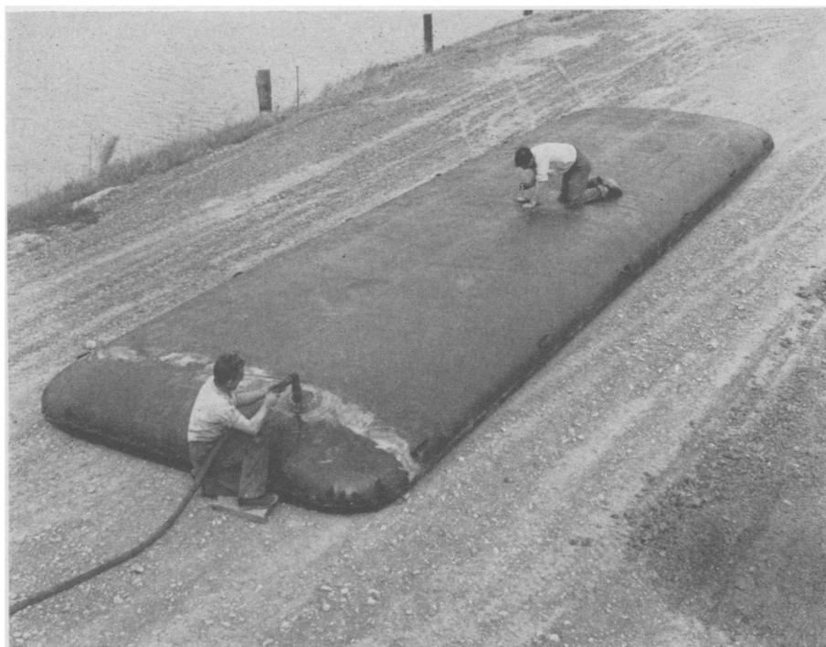
PILLOW TANK —This 10,000-gallon collapsible tank is made of synthetic rubber-nylon and can replace the big steel tanks and 55-gallon drums that have been used to store gasoline for war use. It is transported in a box and for use is spread out like a rug.

The collapsible container has been produced by the U. S. Engineer Research and Development Laboratories to replace conventional steel tanks and the familiar 55-gallon drums that have usually stored petroleum for war use.