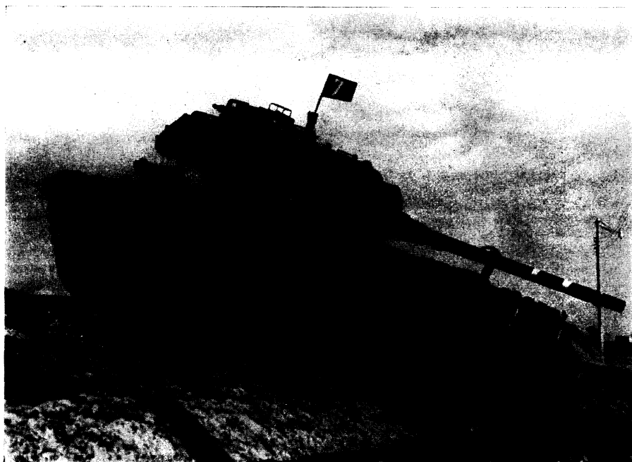
MANEUVERABLE TANK —The M-47 mounts an embankment showing its deadly 90mm, high-velocity gun which is operated by two separate electro-hydraulic fire control systems. "Many hundreds" of these new tanks are being readied for shipment to troops.