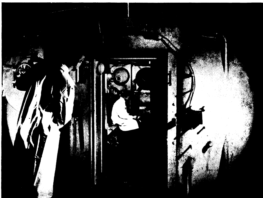
PRESSURE EFFECTS STUDIED —The bomb-like equipment shown here is used by the University of Pennsylvania's Medical School for research on the effects of high altitude and ocean pressure on human beings.