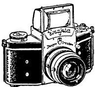
New 1952 Model! 35-mm. EXAKTA "VX" Single Lens Reflex Camera

One lens both for viewing and picture taking assures perfect sharpness, accurate exposure, maximum depth of field, and correct composition for color. You always see the exact image before you take the picture—whether the subject is an inch or a mile away, whether it is microscopic or gigantic, whether it is moving or stationary. Instantly interchangeable lenses permit telephoto, wide angle, close-up, copy and microscope photography. With f2.8 Zeiss Tessar "T" Coated Lens with Pre-Set Diaphragm Control .....$269.50 tax included