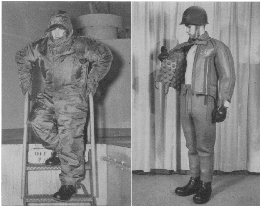
LATEST MILITARY FASHIONS —The sailor on the left models the Navy's new cold-weather uniform which weighs 19 pounds, and which keeps him warm by trapping air between its many layers. The soldier (right) sports the Army's Coldbar plastic underwear which keeps him warm, as well as afloat, even in icy rivers.

To the Marine, the jacket may look alarmingly unprotective. But to a chunk of lead from a .45 caliber pistol or machinegun, the jackets are tough, even at point-blank range. Those bullets are stopped completely. Fragments from a United States-type grenade exploding at three feet are arrested by the jacket before they critically hurt the Marine. Devastating mortar blasts at 10 feet also are less of a hazard to Marines wearing "shrap-jackets."