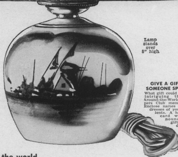
Lamp stands over 8" high