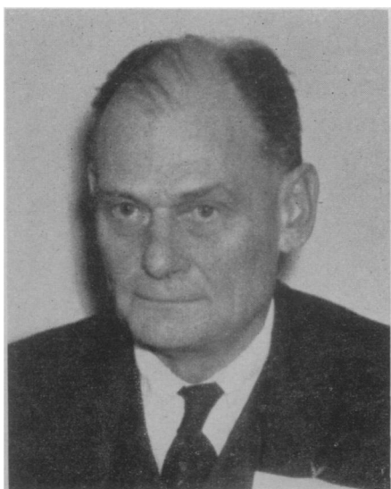
DR. JOHN F. ENDERS