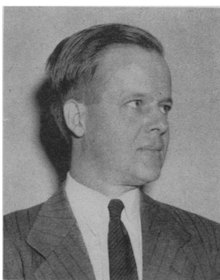
DR. THOMAS H. WELLER