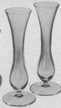
AUSTRIAN BUD VASES 7" high