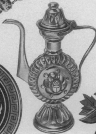
EGYPTIAN COPPER URN 8" high