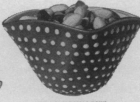
VIKING CERAMIC BOWL 5 1/4" diameter

JAPANESE LANTERN LAMP A modern development of the ancient Japanese Festival Lamp, delicately contoured, sturdily made. As up-to-date as tomorrow. — for any room you have!