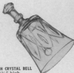
BELGIAN CRYSTAL BELL 4 1/4" high