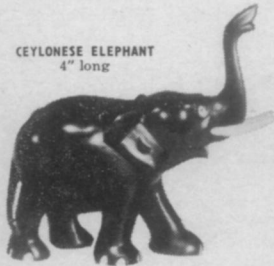
CEYLONESE ELEPHANT 4" long