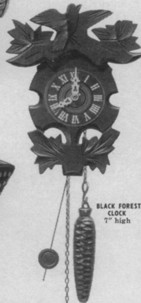
BLACK FOREST CLOCK 7" high