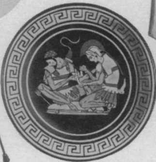
GRECIAN TERRA-COTTA PLATE 7" diameter