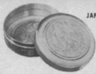
JAPANESE SILVER PILLBOX 1 1/4" diameter