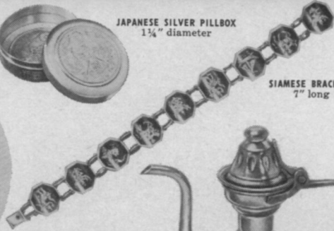
SIAMESE BRACELET 7" long