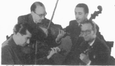
The Pascal String Quartet, one of the world's foremost chamber music ensembles is among the distinguished groups recording for the Society

to take any one of these sets of great chamber works