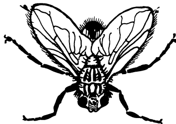
Baits for "Bugs"

➤ ONE of the biggest things about insects is their appetite. The attraction of houseflies, for example, to the odor of foods—fresh or otherwise—is what brings them into unharmonious relations with human beings.