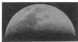
This is an actual photograph of the moon taken through our Astronomical Telescope by a 17-year-old student.

Free with scope: Valuable STAR CHART and 136 page book, "Discover the Stars". Stock No. 85,050-Q.....$29.50 f.o.b. (Shipping wt. 10 lbs.) Barrington, N. J.