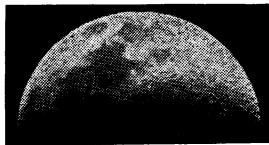
This is an actual photograph of the moon taken through our Astronomical Telescope by a 17-year-old student.