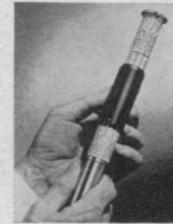
Slide Rule Open

You may use it for 30 days and if you are not satisfied repack and mail it back.