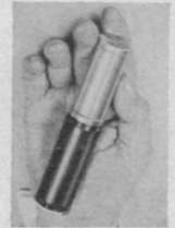
Slide Rule Closed