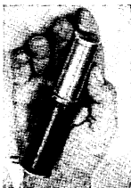
Slide Rule Closed

The GENIAC® Slide Rule solves multiplication, division, percentage calculation and gives 5 place logarithms.