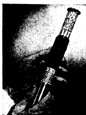
Slide Rule Open

You may use it for 30 days and if you are not satisfied repack and mail it back.