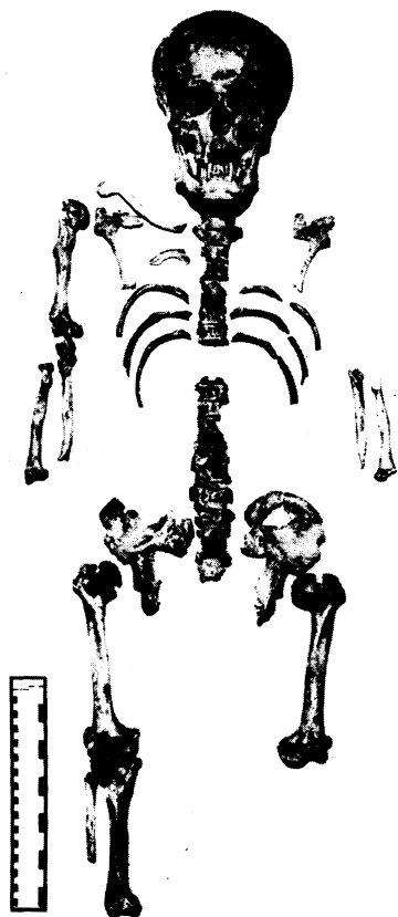
RARE DWARF INDIAN