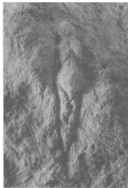
"VENUS" CARVING —This bas-relief carving on a limestone block about nine inches long was carved by a Stone Age craftsman about 22,000 years ago.