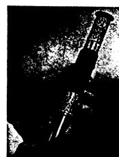
Slide Rule Open

The GENIAC® Calculator carries 66-inch spiral scales yet measures only ten inches fully extended and six inches when closed. Four to five figure accuracy can be relied on. It is indispensable to the scientist, research worker and student. Administrative staff and business men will find it of tremendous value for a host of estimating and checking calculations.