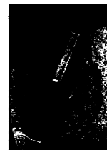
Slide Rule Closed