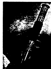
Slide Rule Open

The GENIAC® Calculator carries 66-inch spiral scales yet measures only ten inches fully extended and six inches when closed. Four to five figure accuracy can be relied on. It is indispensable to the scientist, research worker and student. Administrative staff and business men will find it of tremendous value for a host of estimating and checking calculations.