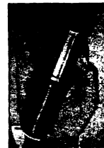
Slide Rule Closed