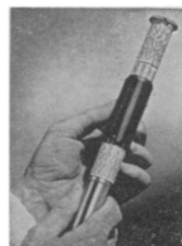
Slide Rule Open

The GENIAC® Calculator carries 66-inch spiral scales yet measures only ten inches fully extended and six inches when closed. Four to five figure accuracy can be relied on. It is indispensable to the scientist, research worker and student. Administrative staff and business men will find it of tremendous value for a host of estimating and checking calculations.