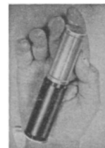
Slide Rule Closed