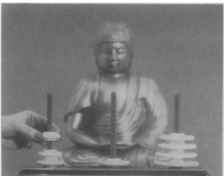
new game from an ancient legend