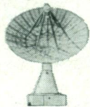
Giant tracking antennae follow you through space!

MAIL COUPON with only 10¢ for the Introductory Package (including sample Activity Kit and, as your special introductory gift, the complete space capsule model). With it we will also send the current Activity Kit for which you will be billed only $1, plus shipping. No further obligation. If you do not wish to continue, simply write us within 10 days. Otherwise, you pay only $1 (plus shipping) for each month's adventure. You may cancel at any time. Send the coupon right now, with only 10¢, to: SCIENCE PROGRAM, Dept. 1-NR-O; Garden City, New York.