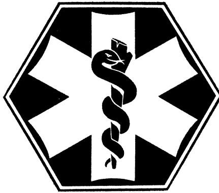
American Medical Association

• Science News Letter, 83:399 June 22, 1963