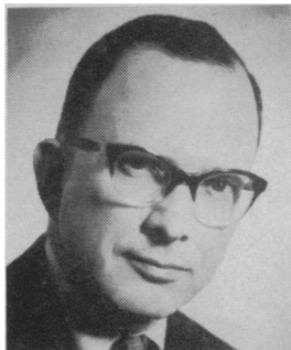
*Dr. Courtlandt Canby, editor of LIFE Magazine's "Epic of Man" and THE NEW ILLUSTRATED LIBRARY OF SCIENCE AND INVENTION.

• Science News Letter, 85:205 March 28, 1964