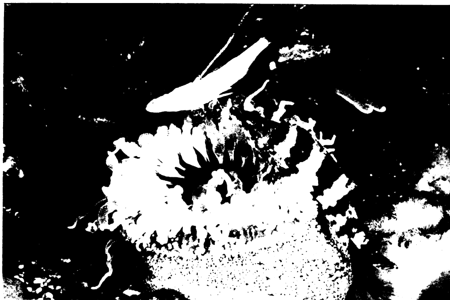
California Academy of Sciences

DINNER IS SERVED —A tasty fish is being popped into the middle of a wreath of waving tentacles—the mouth of a sea anemone. The beautiful but deadly sea animal grabs the fish, closes its tentacles and pushes it into its digestive cavity. Each day spectators can watch the anemones being fed in this manner at the Aquarium of the California Academy of Sciences, San Francisco.