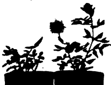
THIS TO THIS

STIMUCEL (Gibberellins-Plus) Contains GIBREL. Mfg. by MERCK & CO.