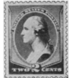
2¢ Washington 75 years old!

YES! We'll rush you 65 all-different U.S. Stamps — including famous "History-in-the-Making" Issues — for only 10¢! (Standard catalogue value guaranteed at least $1.50.) Also Airmails, Special Delivery, Postage Dues, High Denominations, etc. Some over 75 years old! All for only 10¢ with approvals. (Offer open to adults only.) Don't delay. Rush name and address — with 10¢ to help cover shipping, handling—NOW to: LITTLETON STAMP CO., Dept. 1-SNL, Littleton, N. H.