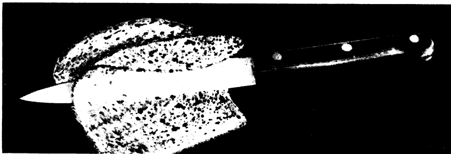
Oil-tempered carbon steel blade with "zero edge" can slice fresh bread 1/16 inch thin.

• Science News Letter, 86:239 October 10, 1964