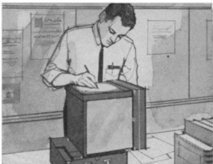
ON TRACING TABLE

Only the Elgeet Micro-Projector Model MP-1 can show your biology slides three ways: 1. Zoom lens fills wall screen. No objectives to change. No turret to rotate. 2. Rear projection screen shows slides even in fully lighted room. 3. Rear projection unit swings upright to form convenient horizontal tracing table.