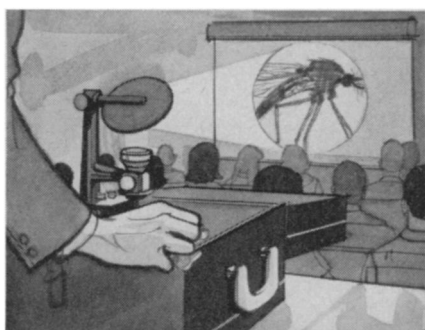
ON WALL SCREEN