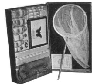
BIO-KIT NO. II For Insect and Animal Collecting

THE collecting season is on! The BIO-KITS contain the necessary supplies and apparatus to enable you to make your own collection in the proper scientific manner. Clear and concise directions for taking proper care of your specimens are given in the BIO-KIT HANDBOOK included in each set. For those interested in plants and flowers, BIO-KIT No. I should be ordered, and for those interested in insects and animals, BIO-KIT No. II is recommended.