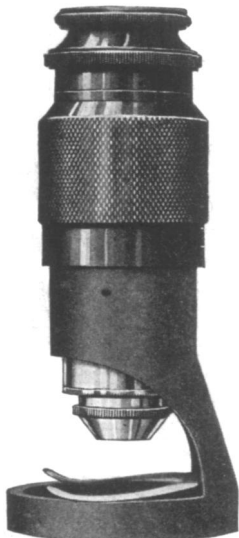
No. 3740 Tami Pocket Microscope with base removed to examine opaque objects

Widely used for botany, entomology, mineralogy, biology, chemistry, geology, and other general microscopic work. The objective is divisible. With the bottom objective lens (F) removed, the magnification ranges from 25x to 112x; whereas with bottom lens attached, magnifications range from 50x to 225x. The variation in magnifications is obtained by extending or collapsing the telescopic draw tubes.