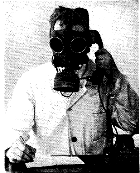
'PHONE GAS MASK