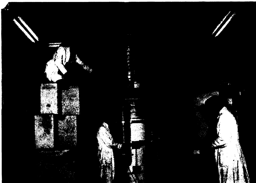
WATER BOILER REACTOR —This “baby” reactor, designed and built by North American Aviation to run on less than one watt of power, is being used to learn more about reactors. The shielding concrete blocks have been removed to show the tank-line housing where the graphite reflector and core are located.