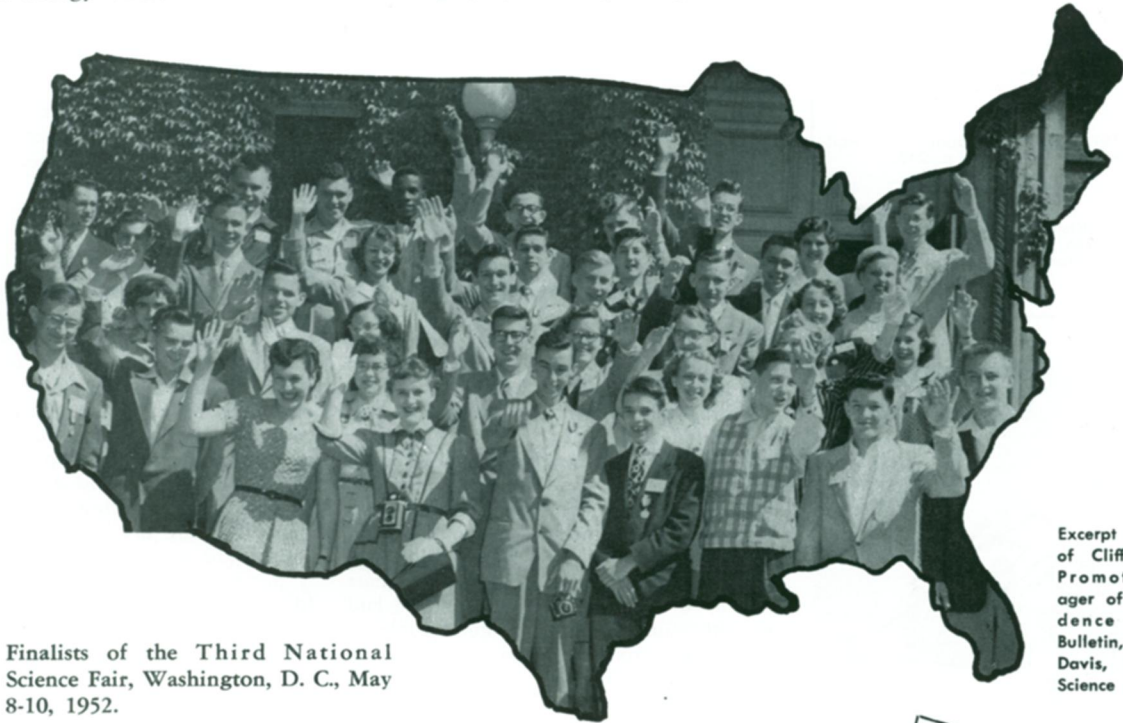
Finalists of the Third National Science Fair, Washington, D. C., May 8-10, 1952.

The National Science Fair is conducted by Science Clubs of America, a Science Service activity. Financial support for the fair program is given by newspapers, civic and industrial organizations, educational institutions and foundations, all cooperating to stimulate student interest in the expanding horizons of science.