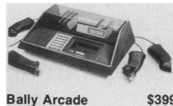
Bally Arcade $399