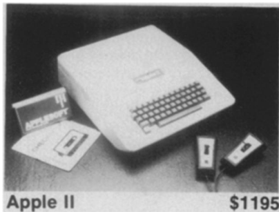
Apple II $1195