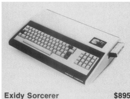
Exidy Sorcerer $895