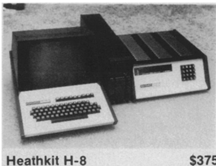
Heathkit H-8 $375