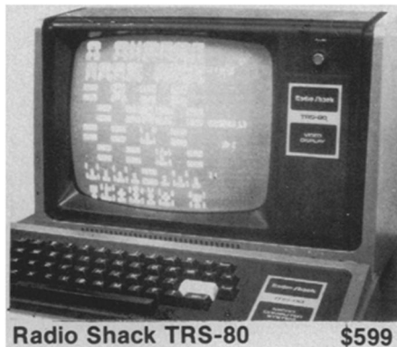
Radio Shack TRS-80 $599