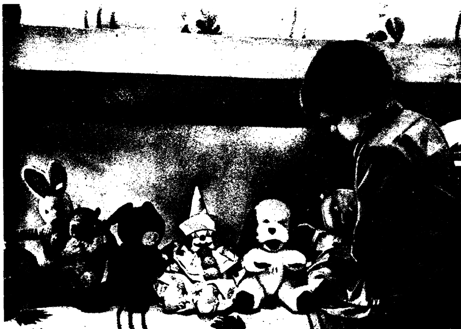
DEFENSE FOR NOCTURNAL TERRORS —Terrors of night haunt all anxious children. They feel better if they have their prized possessions at hand. The boy's animals will keep watch for him during the night.

some cases, take it from a nursing bottle.