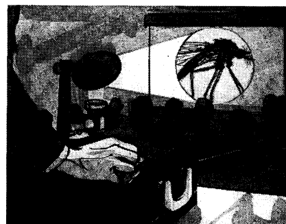
ON WALL SCREEN