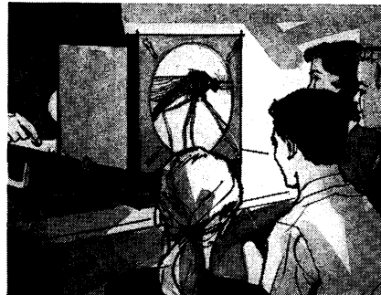
ON REAR PROJECTOR