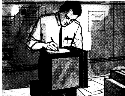
ON TRACING TABLE

Only the Elgeet Micro-Projector Model MP-1 can show your biology slides three ways: 1. Zoom lens fills wall screen. No objectives to change. No turret to rotate. 2. Rear projection screen shows slides even in fully lighted room. 3. Rear projection unit swings upright to form convenient horizontal tracing table. Air-cooled illumination system, live specimens live longer. Horizontal stage for convenient projection of fixed or live specimens. Compact, portable . . . only 12" x 13½" x 8" For no-obligation demonstration, write Elgeet Optical Co., Inc., 303 Child St., Rochester, N. Y. 14611.